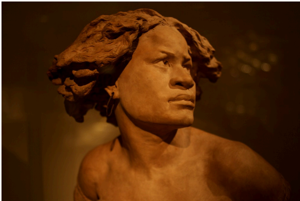
A slave woman

One or more interactive elements has been excluded from this version of the text. You can view them online here: https://opentextbc.ca/abealfreader2/?p=23#oembed-1