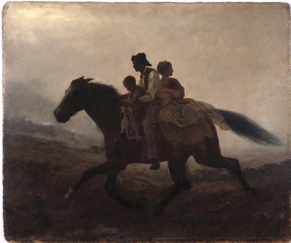
Race to freedom

One or more interactive elements has been excluded from this version of the text. You can view them online here: https://opentextbc.ca/abealfreader2/?p=29#oembed-1