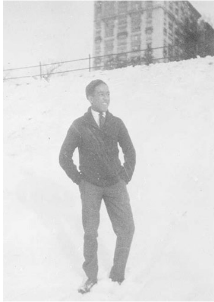
Langston Hughes in high school

– from “ My People ” in The Crisis (October 1923)