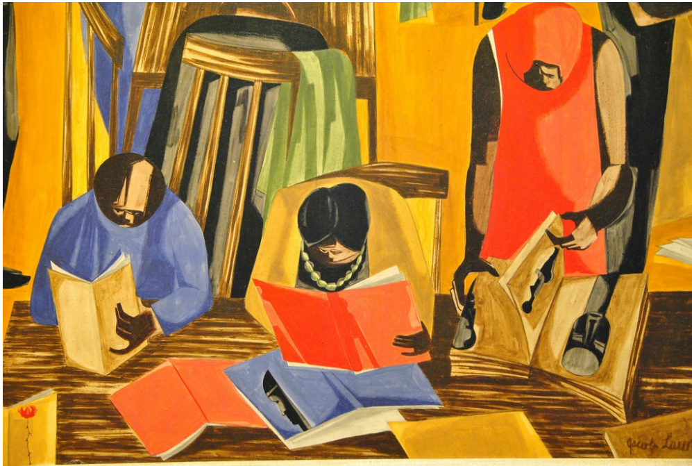
Art from Harlem

One or more interactive elements has been excluded from this version of the text. You can view them online here: https://opentextbc.ca/abealfreader2/?p=48#oembed-1