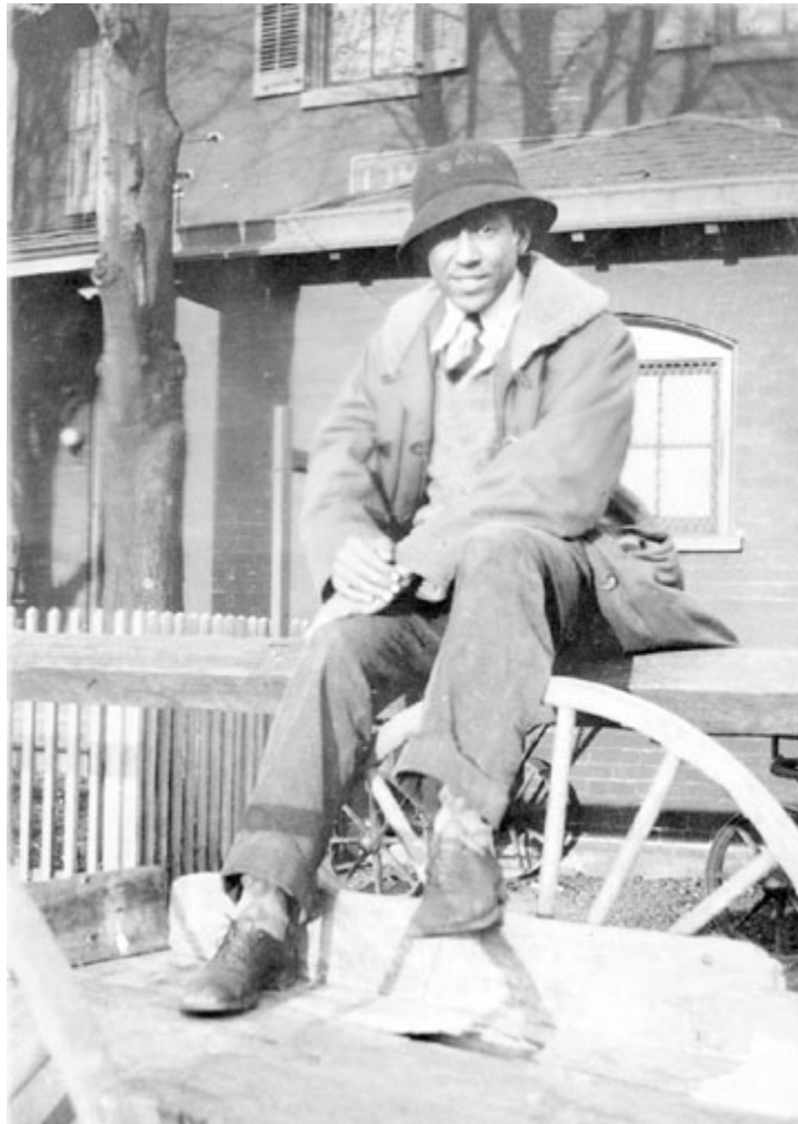
Langston Hughes at university

One or more interactive elements has been excluded from this version of the text. You can view them online here: https://opentextbc.ca/abealfreader2/?p=46#oembed-1