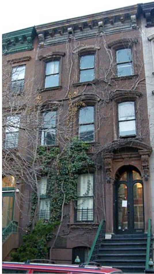
Langston Hughes House

Langston had moved around all his life. But he made a home in Harlem. More and more people read his poems. His poems were printed in books and magazines. People began to pay him to write more poems. Soon he did not need to work other jobs. His job was to write. Langston used his poems to fight racism. You can see this in his poem called “I, Too.” It is about a slave or servant who cannot eat with the white people when company comes. Black people were kept apart from white people in most places outside the home, too.