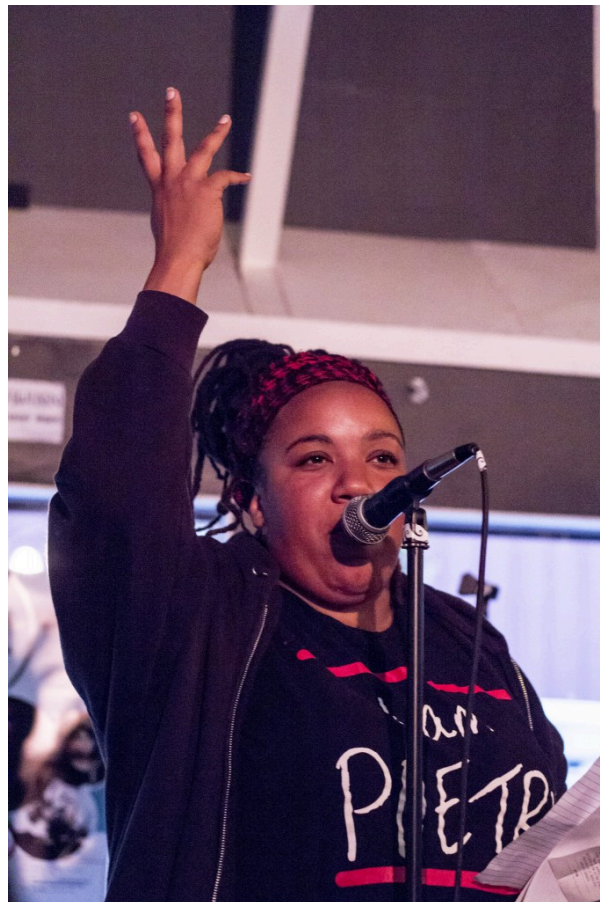
Reading a poem

One or more interactive elements has been excluded from this version of the text. You can view them online here: https://opentextbc.ca/abealfreader2/?p=5#oembed-1