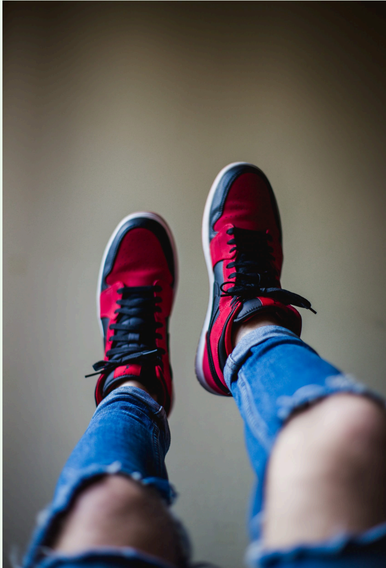
Air Jordans are an iconic shoe that are highly sought-after by Sneakerheads.