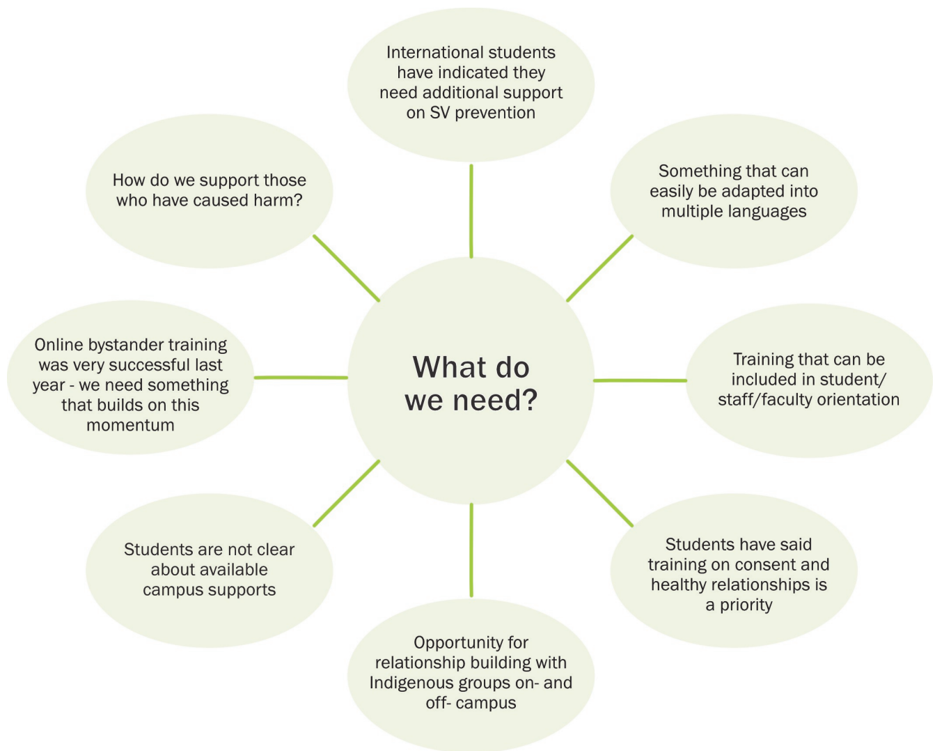
Image description: An example of a filled-out bubble chart with the question “What do we need?” written in the middle. The chart includes the following ideas: