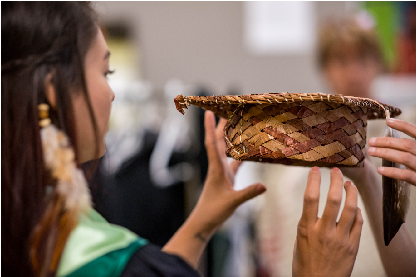
Fig 5.1: UFV Indigenous Graduate Reception 2017