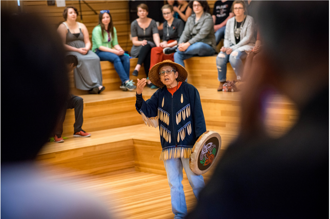
Fig 3.1: Indigenous Graduate Reception