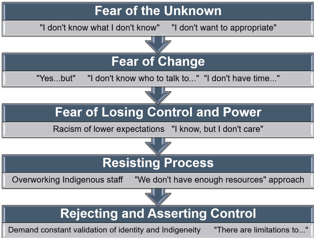
Fig 4.2: Levels of Indigenization. [Long Description]

If you are at a point of Indigenizing your practice, you may still have to face fears and concerns. When developing the framework for the Indigenization project, the project steering committee considered the statements and instances where systemic change is not supported. The committee members then situated them in “levels of Indigenization.” These levels progress from fears to control and then rejection of Indigenization processes. They are not progressive levels, but they show that there are various levels of resistance and barriers to Indigenizing practice, field of study, and institutions.