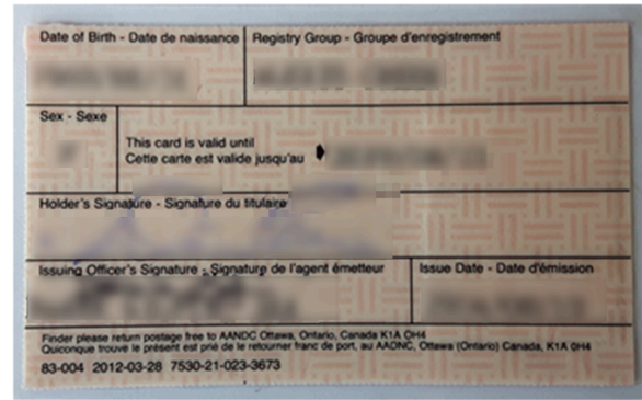
Fig 1.2: Status identity card.