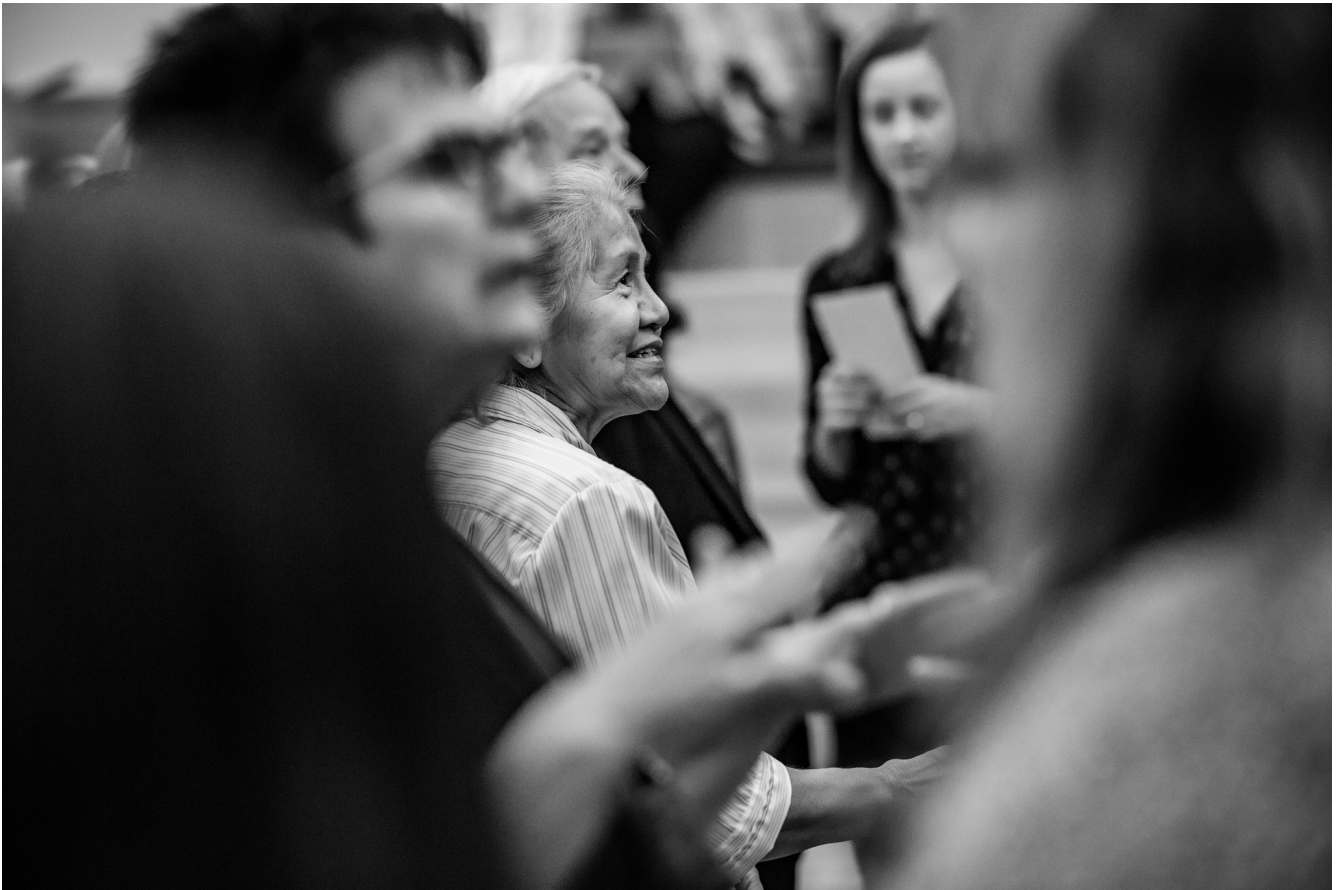
Fig 2.1: Indigenous graduate reception.