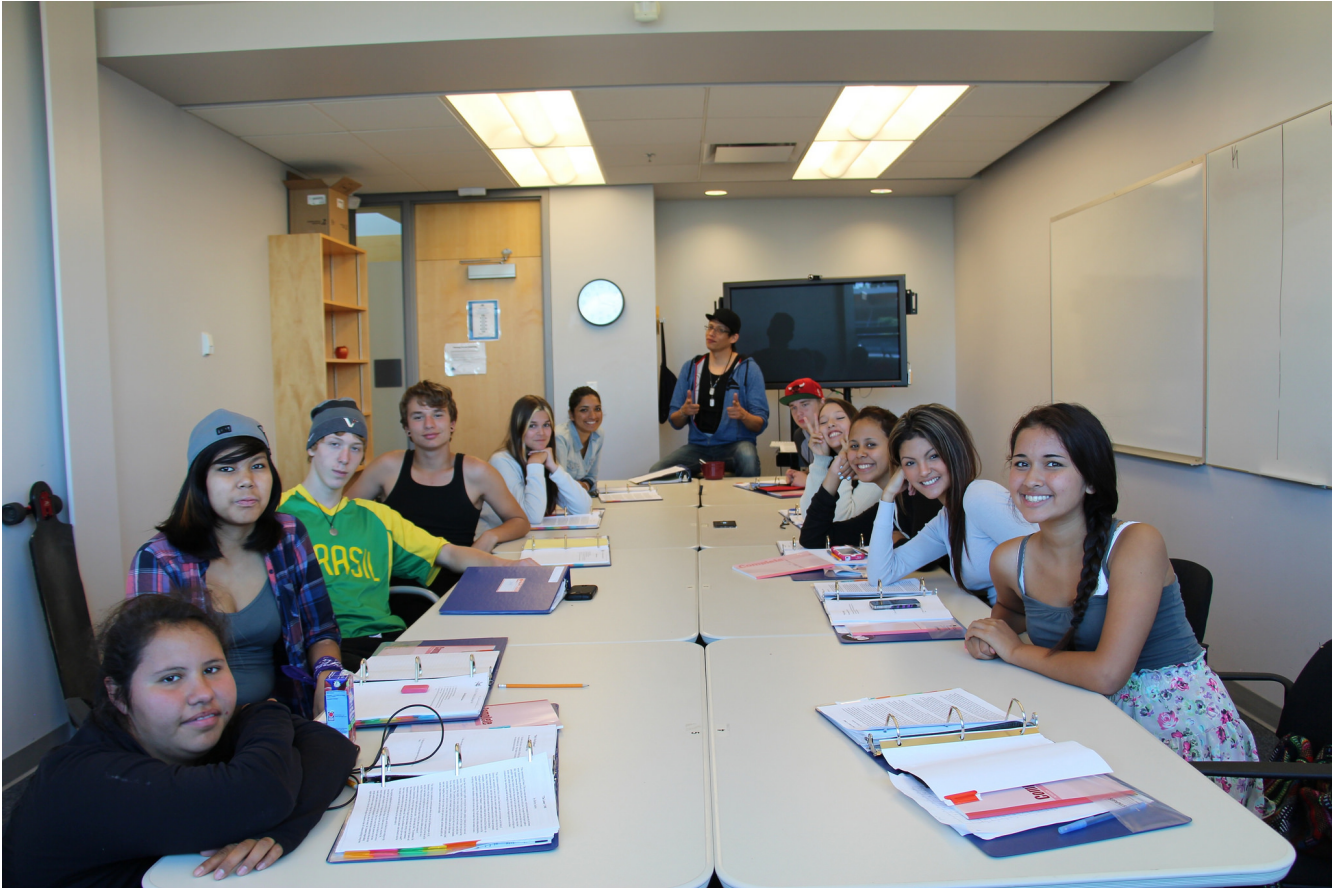
Fig 1.1: Aboriginal math/English camp.