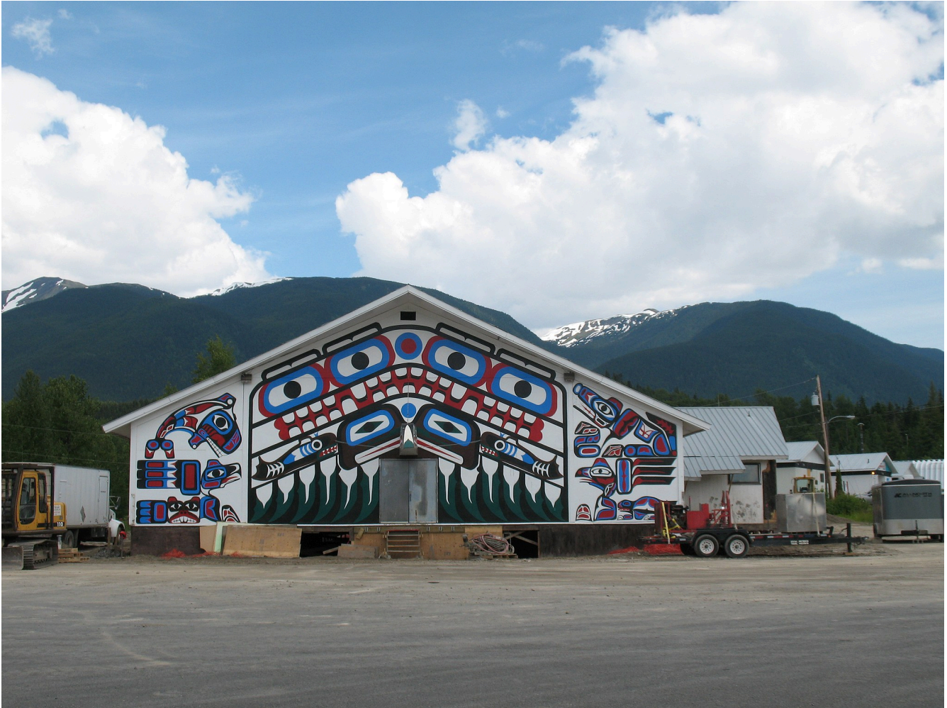
Fig 4.1: Traditional Nisga'a house in New Ayanish.