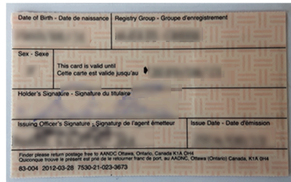
Fig 1.2: Status identity card.