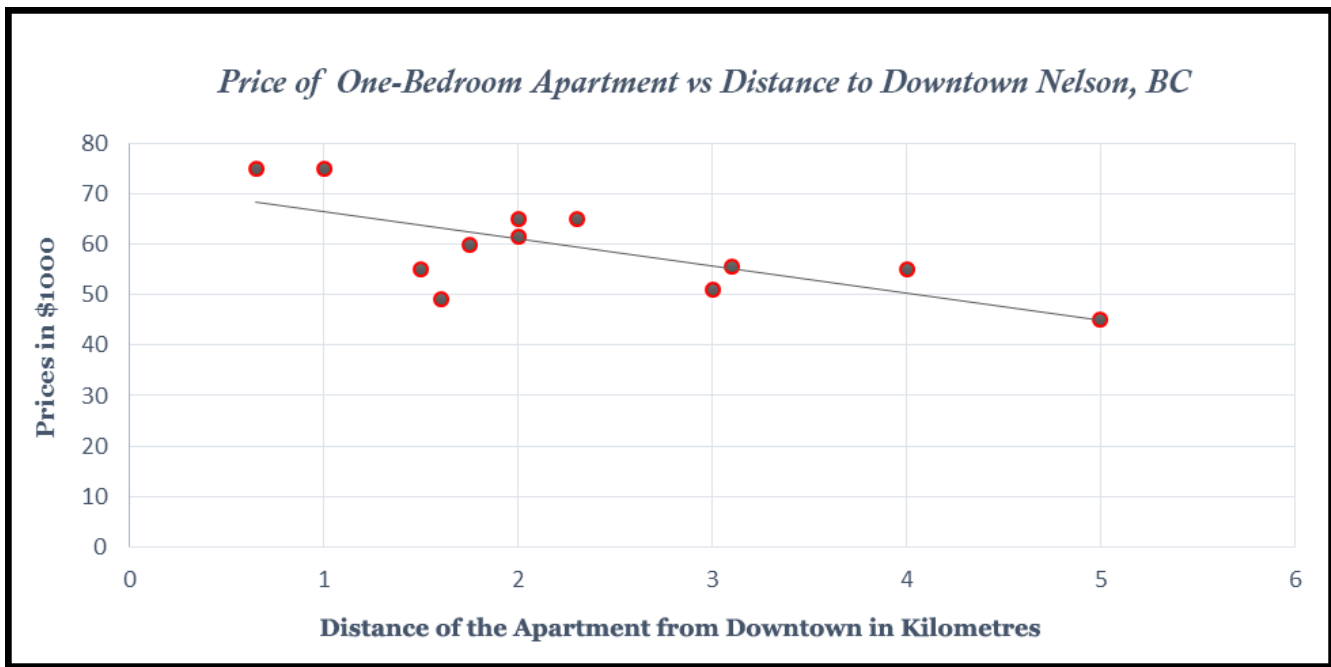
Figure 8.1 Scatter Plot of Price, Distance from Downtown, along with a Proposed Regression Line

In order to plot such a scatter diagram, you can use many available statistical software packages including Excel, SAS, and Minitab. In this scatter diagram, a negative simple regression line has been shown. The estimated equation for this scatter diagram from Excel is: