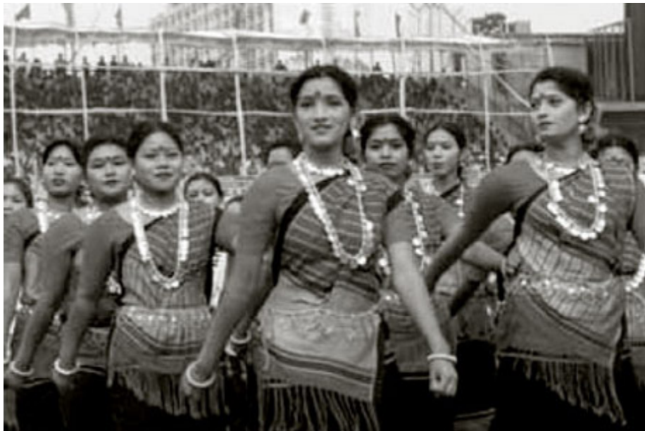
Figure 5 Celebration of a nation: Bangladeshi women parade at a ceremony celebrating the thirtieth anniversary of the declaration of independence from Pakistan, March 2001

globalisation does involve large-scale trends which add up to a significant challenge to our dominant national conceptions of political community. David Held (2000) has recommended that we adapt democracy so that new ‘constituencies’ that cross national boundaries can be recognised and their members participate in decision making on cross-border issues. He and others have also advocated global government through a world parliament and other institutions. Such views see the community as made up of those affected by certain actions or phenomena, regardless of their territorial location and loyalties. It is people affected by, for example, AIDS, acid rain and global warming, who form a new sort of ‘constituency’ and a new type of collective interest. The concern here is about people in different countries, drawn together in new forms of ‘political community’ by having a stake in the outcome of pressing cross-border issues, and the need to downgrade more rigidly national-territorial (and to some degree also legal) definitions of political community.