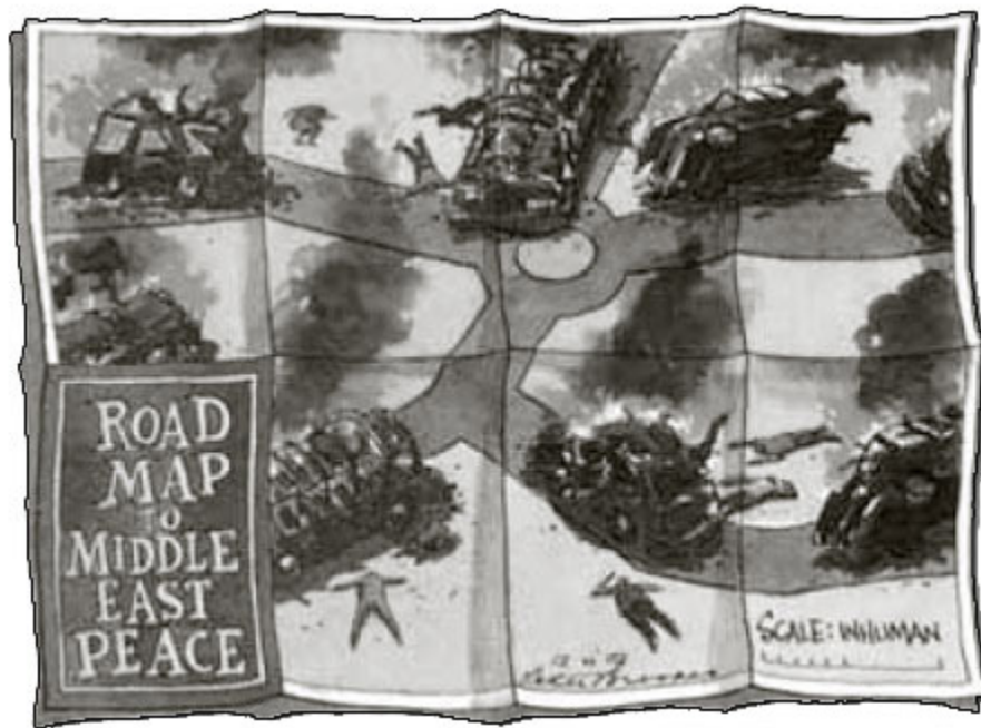
Figure 6: Road map

In this section we have explored the different dimensions of nationalism as an ideology. We now turn to ways in which political theorists have tried to deal with the issue of principles for national self-determination and secession.