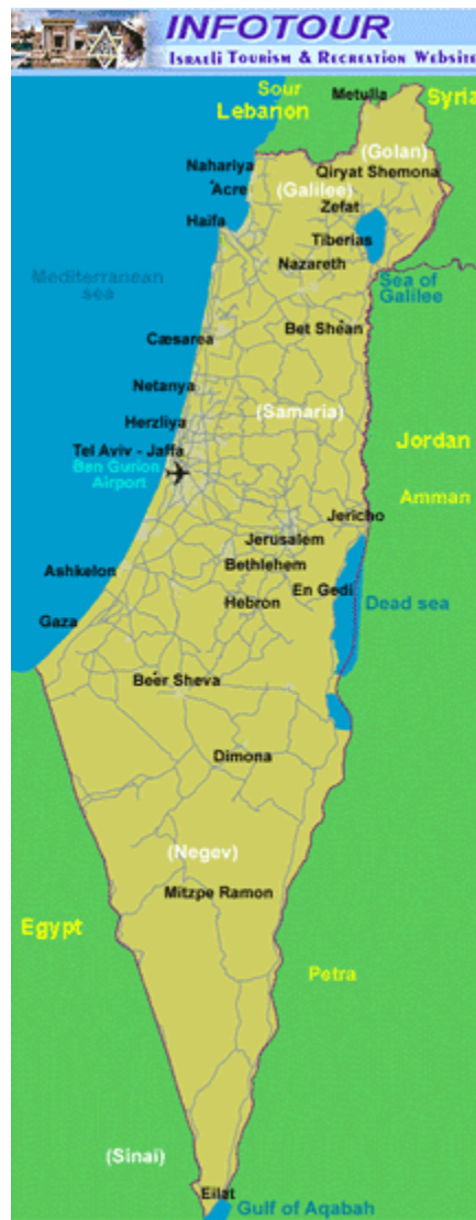
Figure 3 Visual images of a nation: website displaying map for Israeli tourism

There is a large version of the Israeli Tourism map [PDF] .