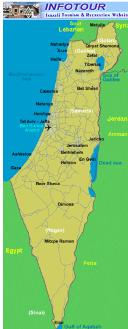
Figure 3 Visual images of a nation: website displaying map for Israeli tourism

There is a large version of the Israeli Tourism map [PDF].