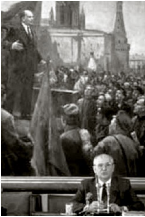
Figure 1 The end of the Soviet Union: Mikhail Gorbachev at a press conference, Moscow, July 1991