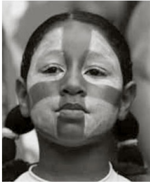
Figure 2 An expression of the English nation: a young football fan watches England v. Iceland

We can see that the problem with so-called objective approaches to defining a nation is finding sound criteria by which one might judge which groups form nations and which do not. How can we weigh different histories, traditions, religions, languages? Any attempt at objective demarcation of national communities is sure to remain contested, not least from among the groups who are thus classified.