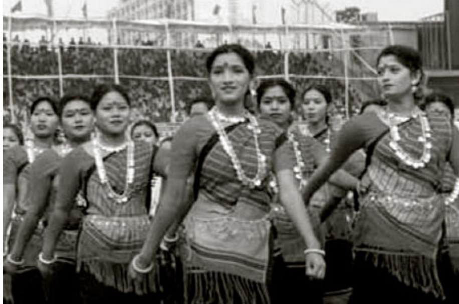
Figure 5 Celebration of a nation: Bangladeshi women parade at a ceremony celebrating the thirtieth anniversary of the declaration of independence from Pakistan, March 2001

participate in decision making on cross-border issues. He and others have also advocated global government through a world parliament and other institutions. Such views see the community as made up of those affected by certain actions or phenomena, regardless of their territorial location and loyalties. It is people affected by, for example, AIDS, acid rain and global warming, who form a new sort of ‘constituency’ and a new type of collective interest. The concern here is about people in different countries, drawn together in new forms of ‘political community’ by having a stake in the outcome of pressing cross-border issues, and the need to downgrade more rigidly national-territorial (and to some degree also legal) definitions of political community.